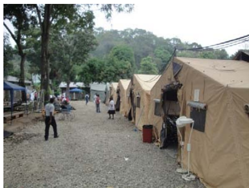
The hospital tents in Milot