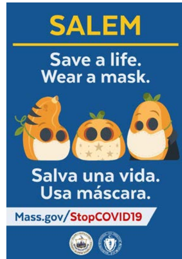
English-Spanish bus shelter sign created as part of the CEIT public messaging campaign.

Residents and communities should follow the Halloween activity guidance released by the Centers for Disease Control and Prevention to understand alternative ways to participate in Halloween that may limit the risk of exposure to COVID-19. As a reminder, any Halloween activities are subject to the current gathering size limits as well as applicable sector-specific workplace safety standards .