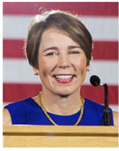
Maura Healey (D) for Governor

Here are the MNA endorsed candidates Primary Elections: