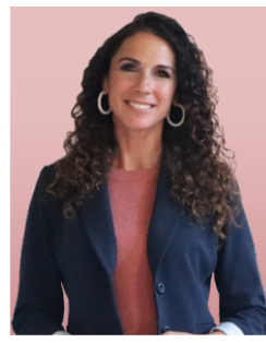
Diana DiZoglio (D) for State Auditor