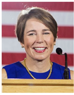
Maura Healey (D) for Governor

Here are the MNA endorsed candidates Primary Elections: