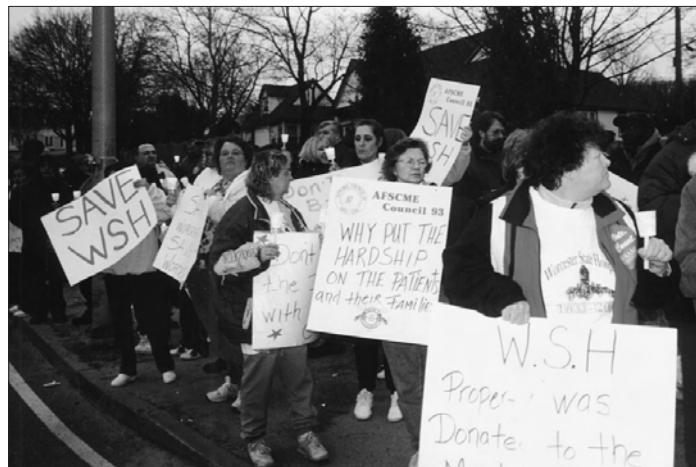
Supporters of Worcester State Hospital join the vigil to protect the state's mentally ill.

Governor Romney had proposed closing Worcester State Hospital in his original budget, but advocates have argued that the facility provides valuable, comprehensive mental health services to patients and families struggling to manage the most acute and debilitating forms of mental illness. In response, the Coalition to Save Worcester State Hospital was formed to wage a campaign to save the facility. The coalition is hoping to gain additional support in the fight to keep Worcester State's doors open. Please show your support for the Coalition, for Worcester State and for the mentally ill by calling your legislators and saying "no" to the proposed closing. ■